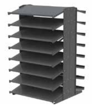
Double-Sided Pick Rack