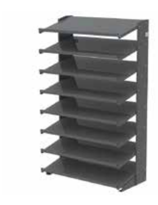
Single-Sided Pick Rack

Customize your small parts organization with a variety of Pick Rack options.