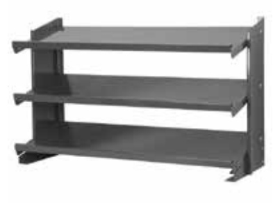
Bench Pick Rack